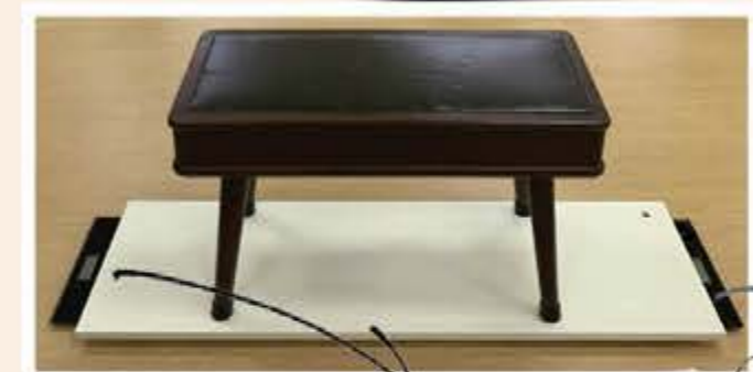
Using 2 digital scales, a plank and a piano bench, to weigh our wheelchair bound clients.

With age, visual perceptions change and the ground looks uneven where the scale is, hence the caution.